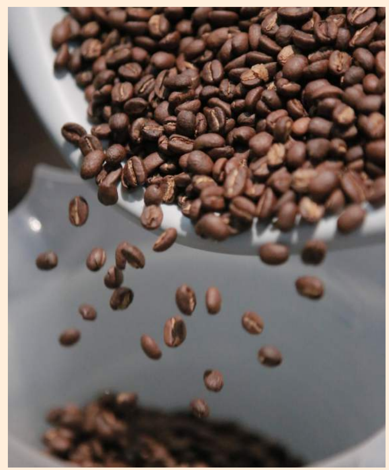
micken coffee | tasty and convenient, anytime, anywhere